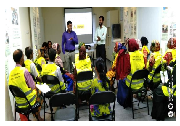
Ankon presenting an overview of the potential dangers faced by landfill workers