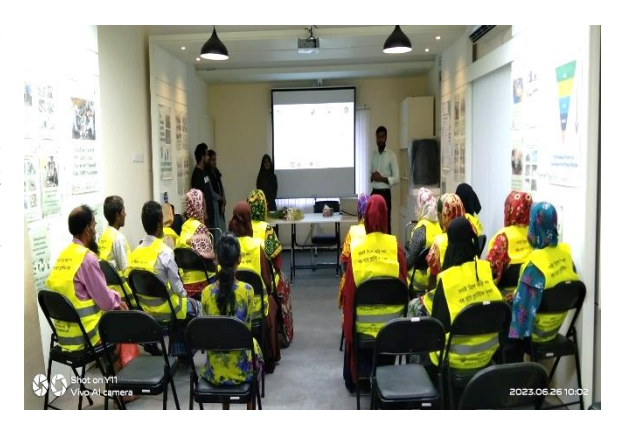
Enjamamul displaying different parts of PPE before the participants

MD Asraful Islam then took charge of the first-aid training session. Through his expertise and interactive approach, he ensured that the first-aid training session was informative, engaging, and relevant to the needs of the informal waste workers. The participants gained knowledge on immediate response measures and acquired practical skills to handle common medical emergencies. The first-aid training covered the following topics: